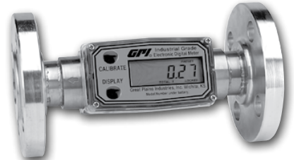
G2 in Stainless Steel ANSI flanged - model SF