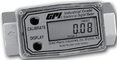
G2 in Stainless Steel - model S

G2 series industrial turbines are a cost effective range of turbines available in a wide range of materials and connection types. Flows from 4 to 760 l/min and a wide fluid compatibility offering make these the perfect choice for any industrial flow metering requirement. Accuracies range from +/-0.75% on larger models to +/-1.5% on smaller models.