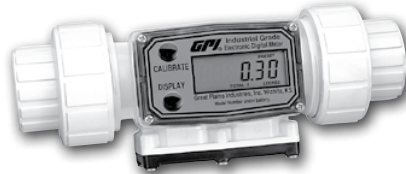
G2 in PVC - model C